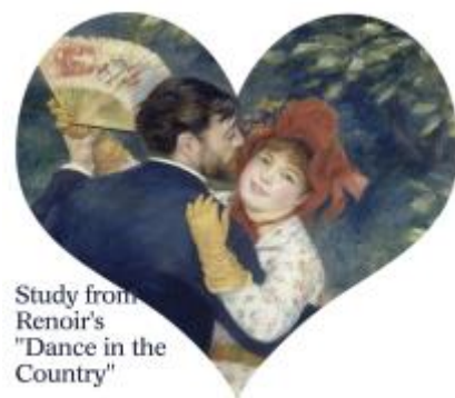
Study from Renoir's "Dance in the Country"

Producing thousands of paintings in his lifetime, Renoir's work in review shows an artist driven by love. After his marriage in 1890, he turned his attention to capturing his wife, family life and children. In his late career, after a diagnosis of rheumatoid arthritis that left his fingers permanently disfigured, he still continued to create, hiring an assistant to help him realize his artistic visions in sculpture.